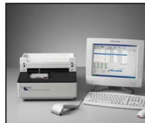
AutoReader with SWIN™ Software