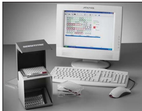
Manual System with SWIN™ Software