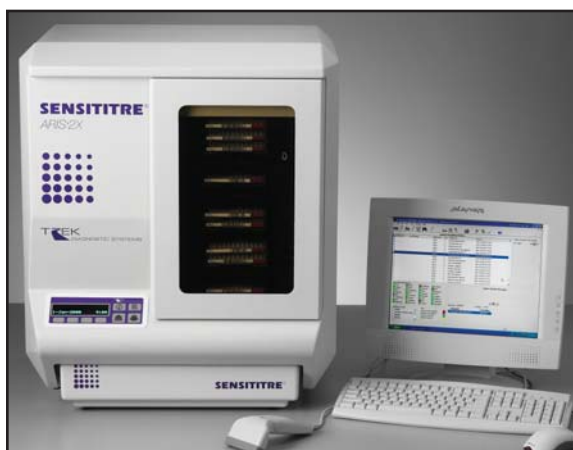
ARIS® 2X and SWIN™ Software